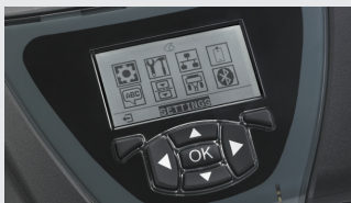
Easy-to-read display with larger, higher-resolution screen