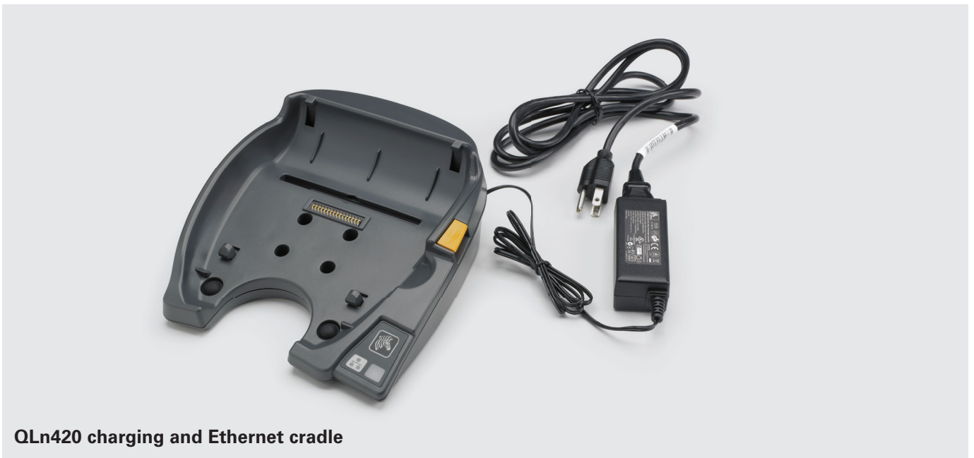
QLn420 charging and Ethernet cradle