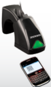
Base can be secured to a counter or wall for fixed applications